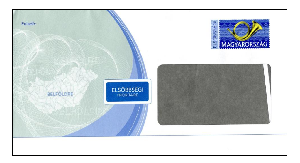
(Specimen no. 2)

2.2.3. Prepaid non-priority and window envelope non-priority standard and medium-sized envelope