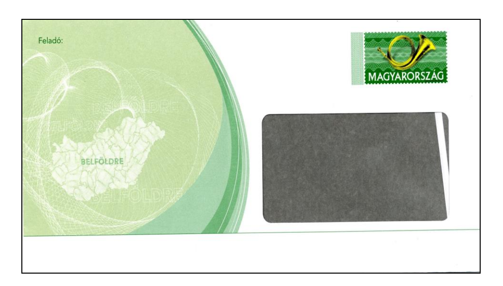
2.2.4. Prepaid registered, standard and medium-sized registered window envelope